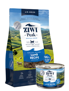
LAMB RECIPE Air-dried and wet