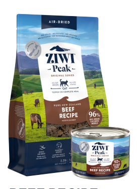
BEEF RECIPE Air-dried and wet

Can be used as a novel protein diet for ferrets experiencing food allergies.